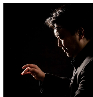
Romantic British Piano Sonatas (forthcoming)