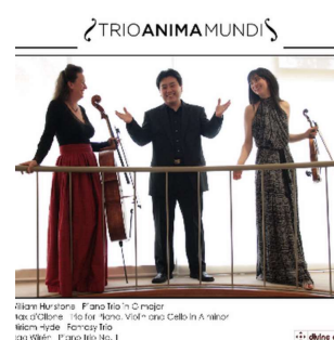
Trio Anima Mundi: Romantic Piano Trios With Trio Anima Mundi 2013 Musicweb International Recording of the Year