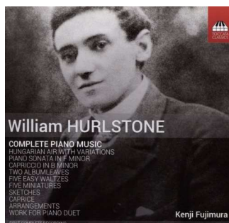
William Hurlstone: Complete Piano Music Musicweb International Recording of the Month – May 2015