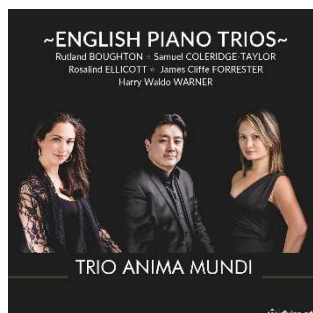
English Piano Trios With Trio Anima Mundi (forthcoming January 2020)